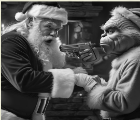
Is this a plain ole "stick up" during the Holiday Season or passive extortion?

come once every 4 years, however, to refresh everyone's memory, the taxes since 2020 went approximately like this: