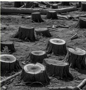
Deforestation above Save the Cedar League below https://savethecedarleague.org