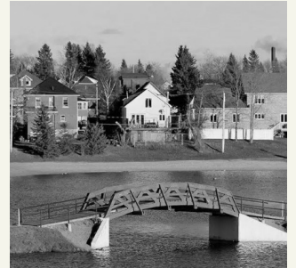
An Alluring snap shot from the Town of Cochrane