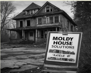
Are Levy Hikes turning your dream into Mold?

that our governments have our backs? Or, are they only worried about themselves by imposing virtual meetings and